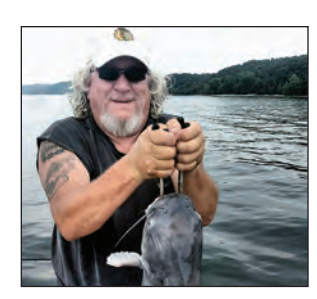
RICH BAY (Kentucky) Guides for All Species Out of a Custom Rigged Pontoon Boat